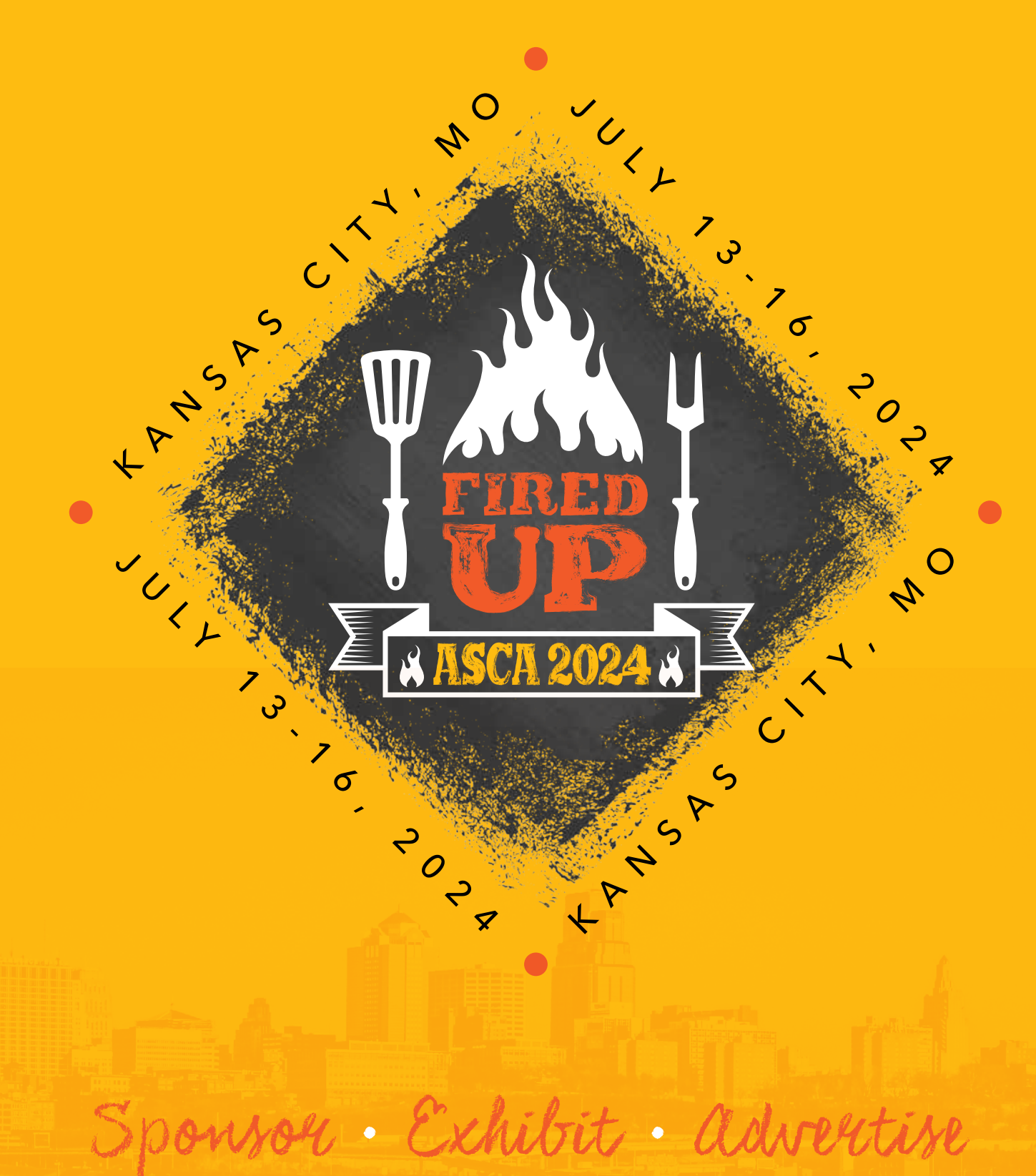
EXHIBIT DATES ARE JULY 13-16, 2024

Contact Brian Levy, blevy@schoolcounselor.org • (571) 329-4358 or book online at bit.ly/2024-exhibit-sponsor